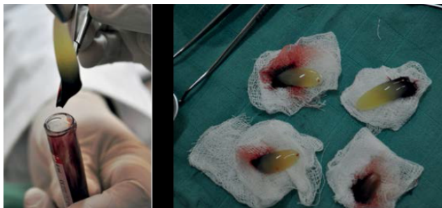
Fig. 2: PRF clot removal